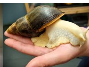
Sheldon Stratford African land snail