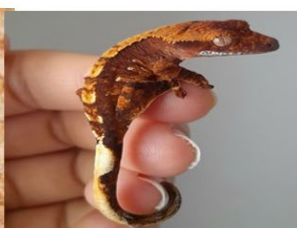
Gracie Grosvenor Crested gecko