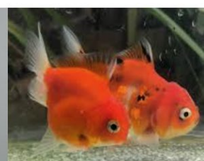
Dug and Dave Dee Pearlscale fish

As we currently have no livestock animals or birds on site students will take several trips to farms, animal shelters and zoos during the 2 years so they can gain knowledge of how to handle, prepare accommodation and assess health of these groups of animals.