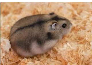
Winifred Windsor Russian dwarf hamster