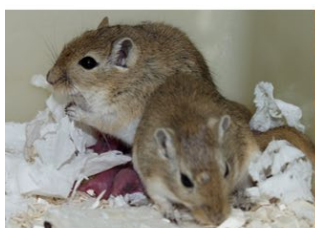
Lily and Lola Lane Gerbils